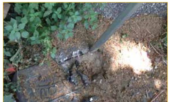
Useful for cutting layers of asphalt and concrete, cleaning and peeling dirt, which often cover the surface and the frame of the lid.