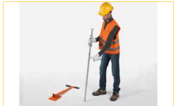
The ergonomics of the MZ120 allows the use of the tool in standing up position and its conical tip made in tempered steel guarantees durability and robustness.