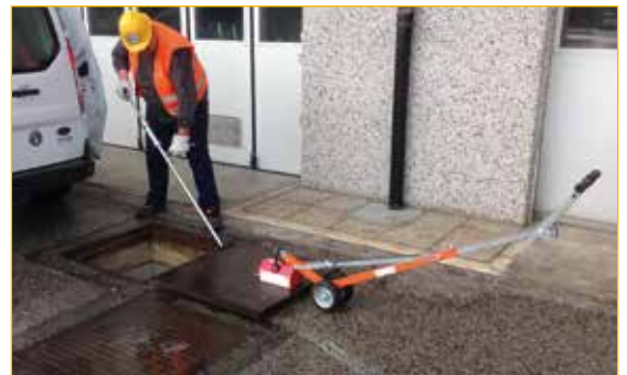
MZ120 particular shape allows you to unlock the safety lock of the lids and, subsequently, to be used as a lifting lever.