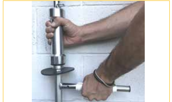
Safety pin when hammer is not in use.